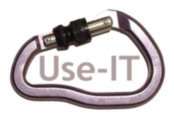
Figure 2.1: USEIT logo

The project logo defines the project visual identity, creates an easily recognizable "image" and helps to improve the visibility. It should be used prominently in all dissemination tools and printed materials. Figure 2.1 shows the USEIT logo.